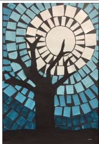
Winter trees using finger painting or mosaics for the sky