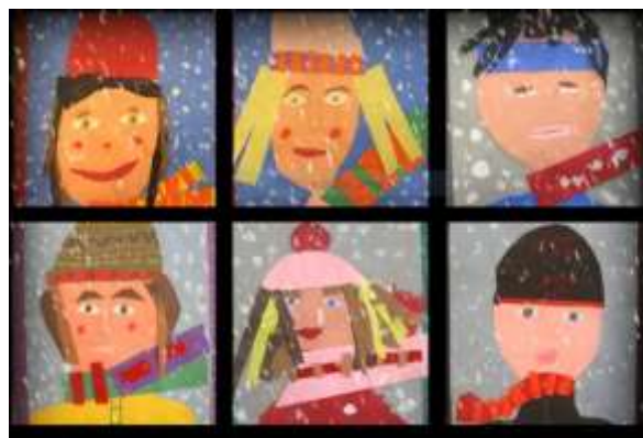
Use different coloured paper for the houses or people and then white paint for snow